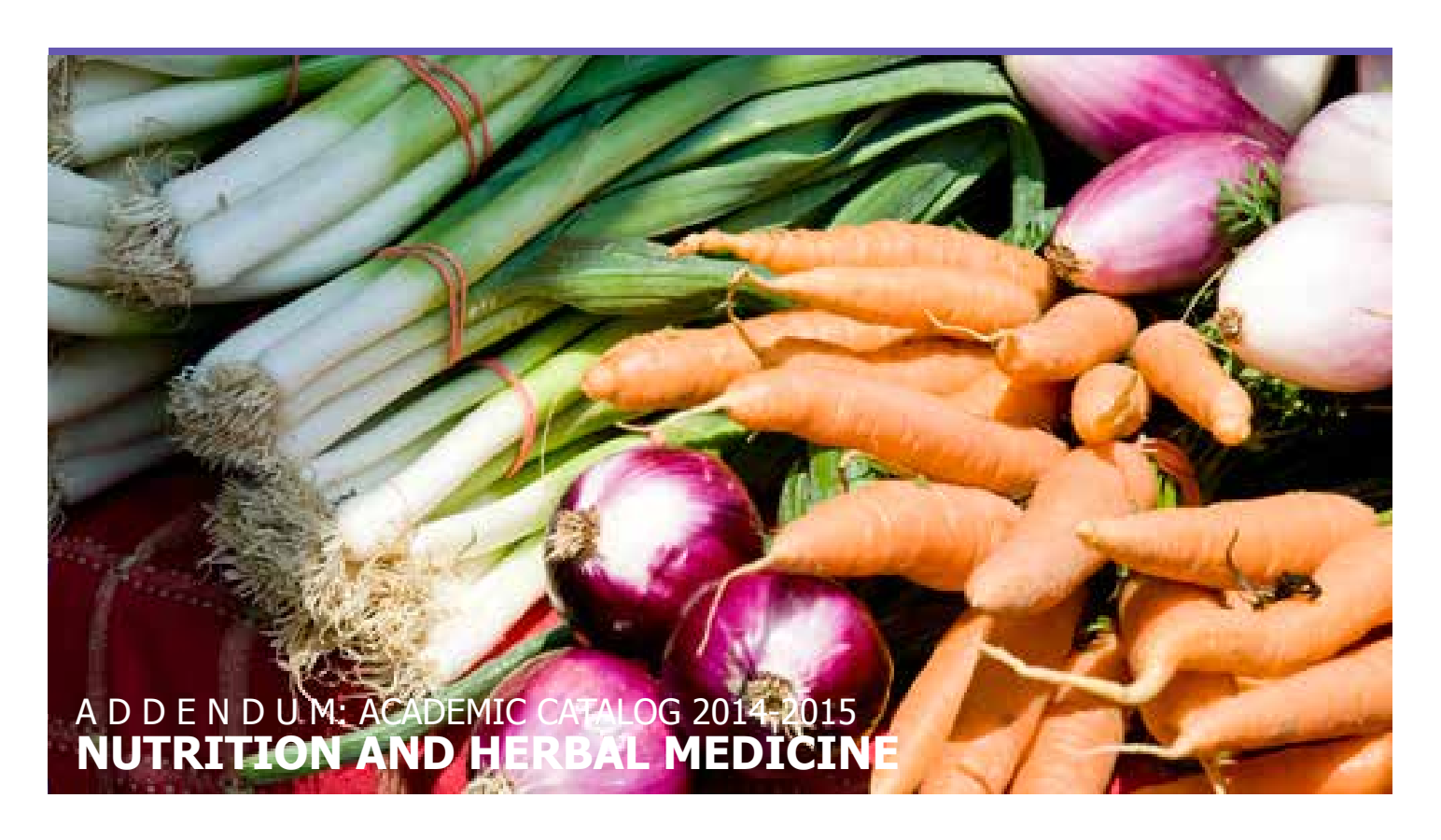
Nutrition And Herbal Medicine Department